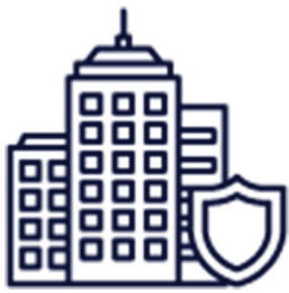
A-RATED STRUCTURAL WARRANTY COVER

At Roylemac10 we can arrange a wide range of services for our clients. These services include: