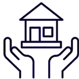
BUILDING CONTROL SERVICES ( DUAL INSPECTIONS )