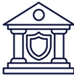
RETROSPECTIVE STRUCTURAL WARRANTY COVER