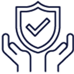
MIXED USE COVER