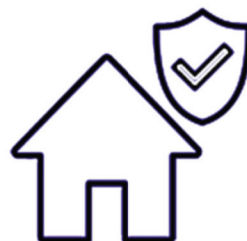
DEVELOPER DEPOSIT PROTECTION