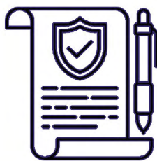
INSURANCE BACKED GUARANTEES ( IBGS )